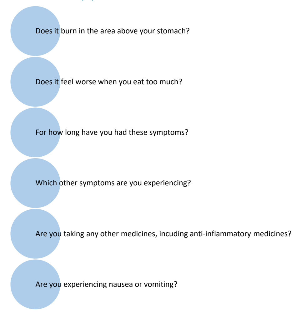
Figure 4. Useful questions to assess reflux symptoms

Besides these questions, a review of the patient's current medication regimen can be useful to ensure appropriate pharmacological management options (Chapter 5). <sup>29</sup> This can then be complemented with further recommendations on non-pharmacological options (Chapter 6).