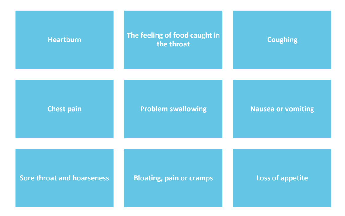
Figure 2. Common symptoms associated with reflux conditions

Red flag symptoms include the presence of blood in the gastrointestinal tract, persistent vomiting, progressive unintentional weight loss (up to 5% of the body normal weight over six to 12 months without an identifiable cause), chest pain, pain when swallowing (odynophagia) or severe difficulty in swallowing (dysphagia). Other factors that need referral for further evaluation include anaemia, any palpable masses in the gastrointestinal tract area and family history of upper gastrointestinal cancer (Figure 3).<sup>24, 25</sup>