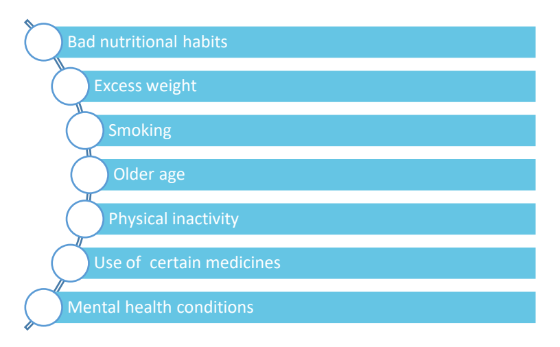
Figure 1. Risk factors for the development of reflux symptoms

Reflux symptoms are a common clinical presentation worldwide with approximately half of adults experiencing such symptoms at some point in their lives. <sup>9</sup> Risk factors for reflux disease include poor nutritional habits such as excessive consumption of fat, spices or irritant foods and drinks, being overweight, smoking, older age and physical inactivity, alongside some mental health conditions such as anxiety or depression (Figure 1). <sup>10, 11</sup>